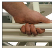
No "Pinch Point" Rails