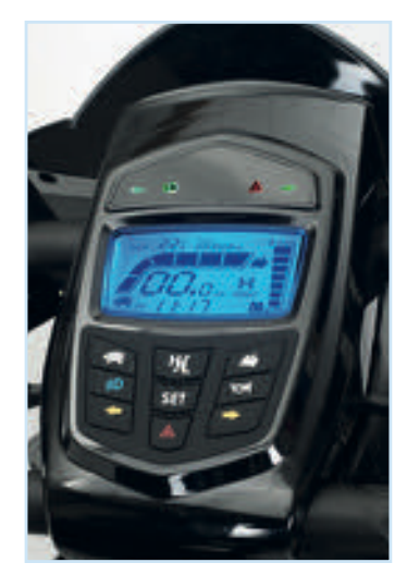
Digital LED display