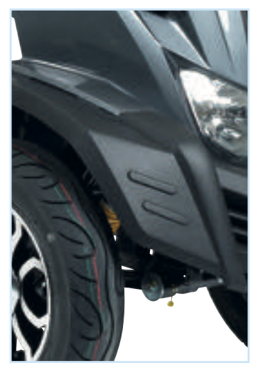
All round suspension